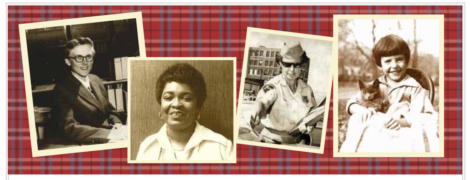
A friend said, during her interview: This is the first time you and I, in all the years we've known each other, have ever sat down to talk with each other, and it's a little anxiety provoking. At the same time, I'm very happy to do it because as we always say, "Everyone has a story to tell, and I have one that is intriguing."