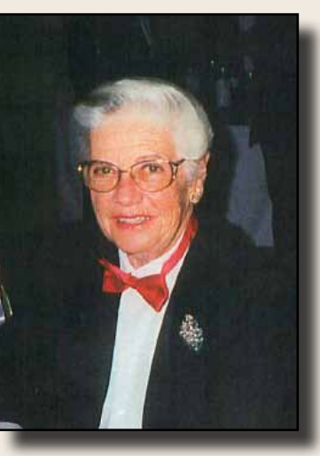
Age 68 in 1998