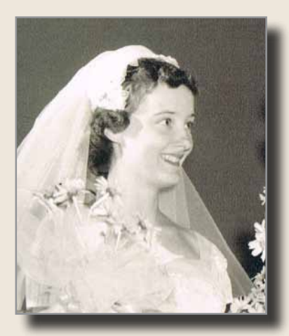
Young bride, 1959