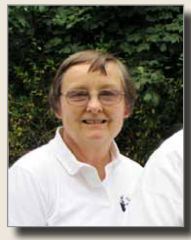
Age 72, 2011